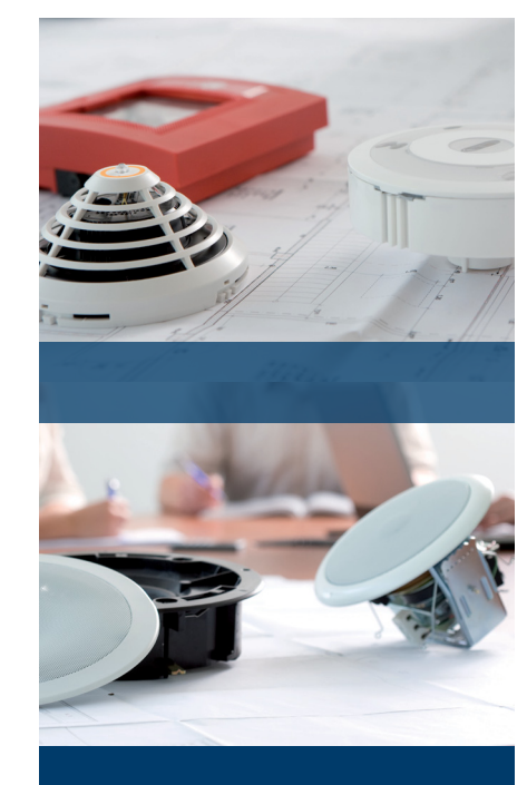
Each system uses a wide range of state-of-the-art peripherals to ensure maximum safety

The addressable fire alarm system includes high-quality panels and peripherals designed for earliest detection. Advanced detectors, interface modules, manual call points, sounders and other peripherals add flexibility and support special applications. Maintenance is easy, with permanent supervision of all system functions and peripherals for added reliability. For smaller venues, the Fire Panel 1200 Series supports up to 254 peripherals, and, in large facilities, a networked solution with the Modular Fire Panel 5000 Series can accommodate up to 32.000 peripherals.