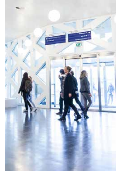
PAVIRO: Public Address, Voice Evacuation, and Professional Sound Quality