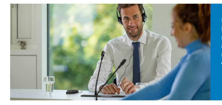
INTEGRUS in combination with DICENTIS is the perfect solution for multilingual meetings in international organizations and businesses, ensuring perfect reception and a comfortable audio experience.