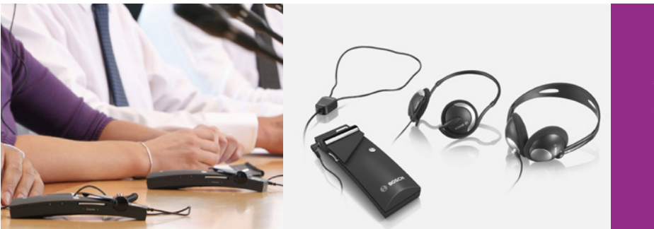
INTEGRUS Pocket receivers have been optimized for use with Bosch headphones, which ensure the best sound quality.