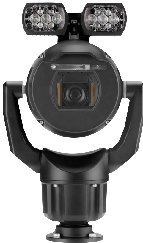
MIC inteox 7100i

For more information on MIC cameras for ITS, contact intelligent.transportation@us.bosch.com