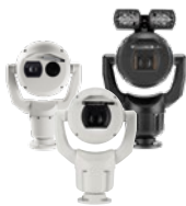
MIC IP camera family

Bosch offers a complete camera portfolio for intelligent transportation systems. NEMA TS 2 certification confirms they meet environmental requirements for traffic applications, while NTCIP compliance ensures communication with traffic management systems.