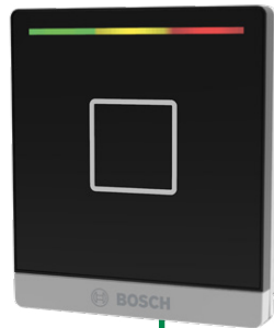
Access control premium readers with BLE (Bluetooth Low Energy)