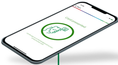
Mobile Access application for smartphones