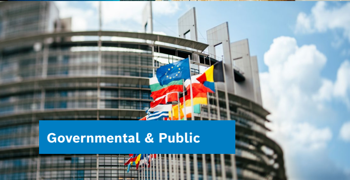
Governmental & Public