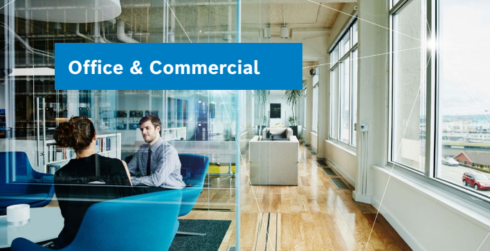
Office & Commercial