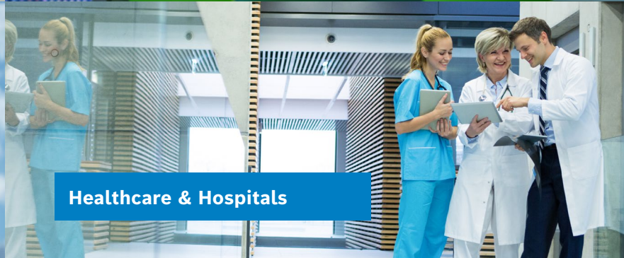
Healthcare & Hospitals