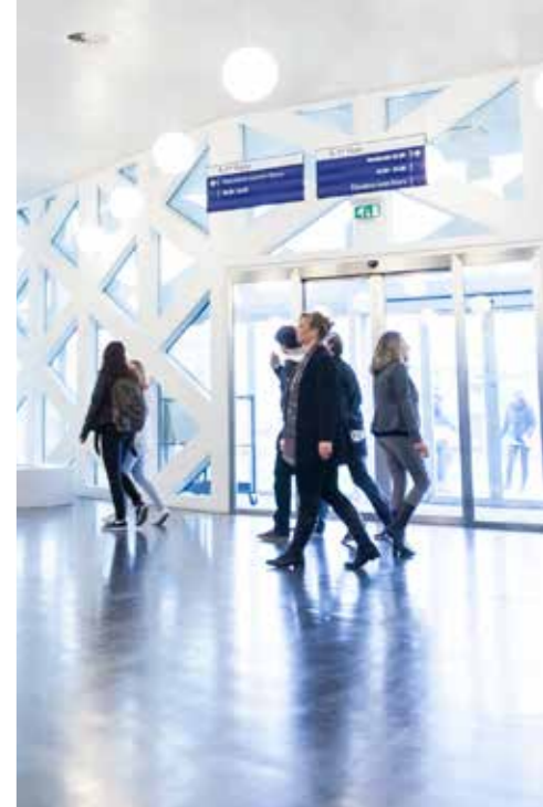
PAVIRO: Public Address, Voice Evacuation, and Professional Sound Quality