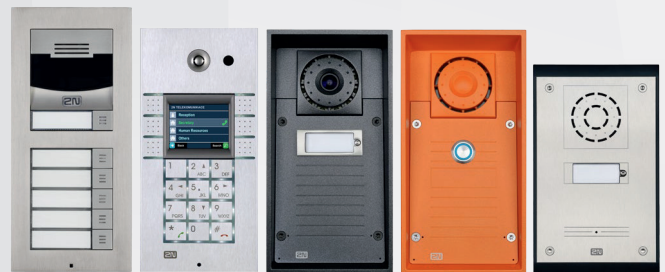
2N® Helios IP Verso

The start screen is an introductory overview screen displayed upon login to the intercom web interface. The start screen is also the first menu level and quick navigation (click on a tile) to selected intercom configuration sections. The 2N® Helios IP configuration includes 5 main menus: State, Directory, Hardware, Services and System including submenus.