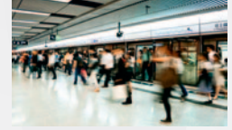
Railway and metro