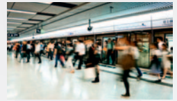
Railway and metro