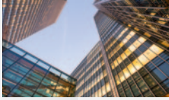
Commercial and office buildings