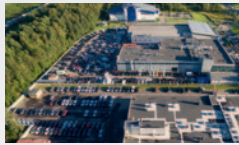
Industry and manufacturing plants