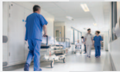
Health care and hospitals