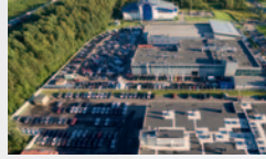
Industry and manufacturing plants