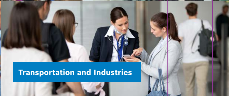
Transportation and Industries

Example 1: After a fire alarm or security threat in an area, the BIS operator can quickly release an announcement in the respective area.