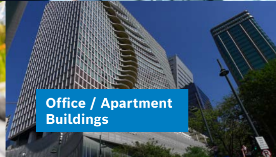
Office / Apartment Buildings