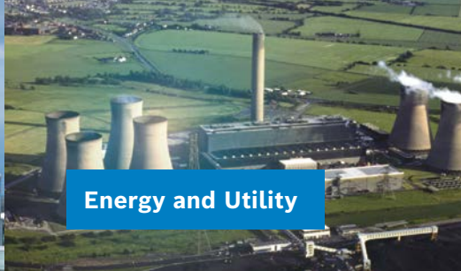
Energy and Utility