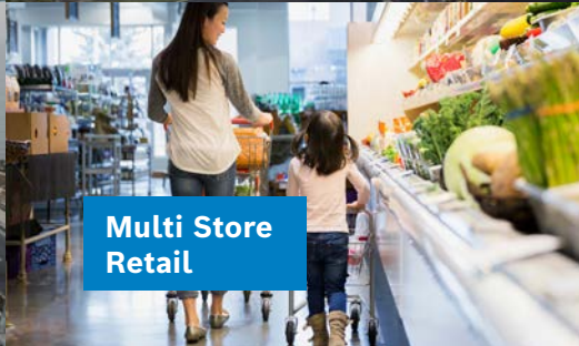
Multi Store Retail