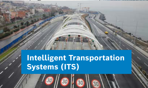
Intelligent Transportation Systems (ITS)