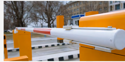
Entrances with barriers