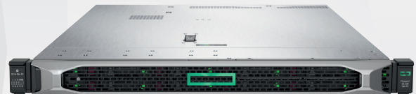
HPE DL360 Gen10

The Bosch division Security and Safety Systems is a leading global supplier of security, safety, and communications products, solutions and services. Protecting lives, buildings and assets is our aim. The product portfolio includes video surveillance, intrusion detection, fire detection and voice evacuation systems as well as access control and management systems. Professional audio and conference systems for communication of voice, sound and music complete the range. Bosch Security and Safety Systems develops and manufactures in its own plants across the world. Additional information can be accessed at www.boschsecurity.com