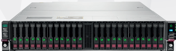
HPE Apollo 4200 Gen10