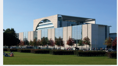
Public authorities: large campuses, public areas and buildings