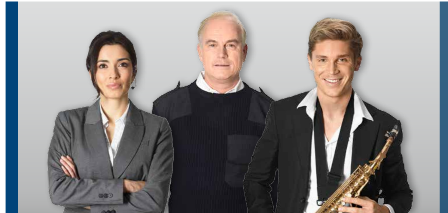
PAVIRO: Public Address, Voice Evacuation, Professional Sound Quality

Thanks to its powerful range of features, PAVIRO not only answers an extremely wide variety of application requirements, it also delivers best-in-class performance in quality, ease of installation, and versatility. At the same time, it minimizes operational costs thanks to low energy consumption and fewer batteries.